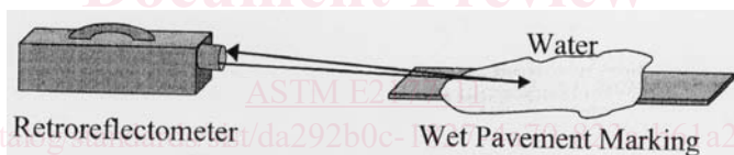
FIG. 1 Illustration of Measurement

1.6 This standard does not purport to address all of the safety concerns, if any, associated with its use. It is the responsibility of the user of this standard to establish appropriate safety and health practices and determine the applicability of regulatory limitations prior to use.