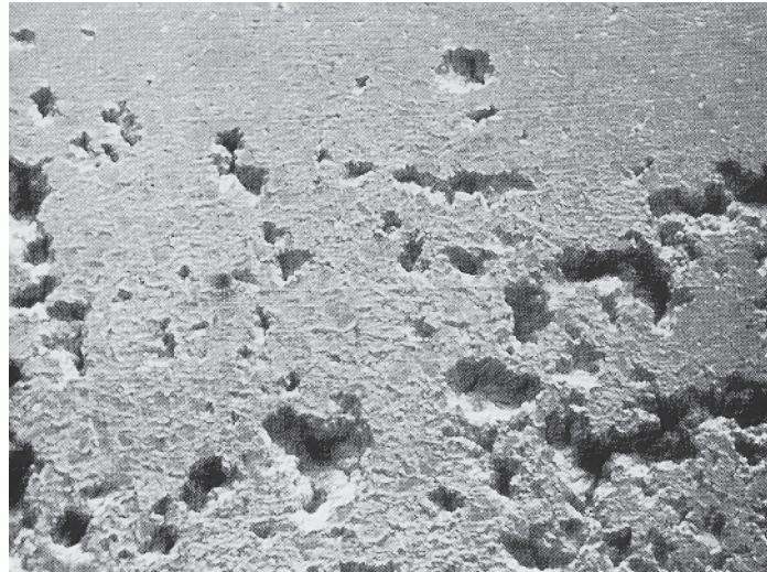
a) View under magnification