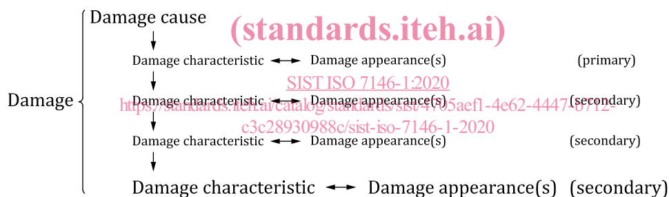
Figure 1 — Damage appearances altering with the progress from primary to secondary characteristics

Typical relationships are shown in Table 1 for damage to sliding surface and to bearing back. In most cases, Table 1 is the guideline for diagnosis of the final damage cause from the damage appearances via the damage characteristics.