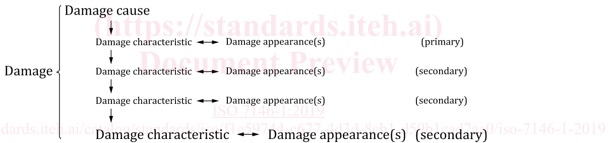
Figure 1 — Damage appearances altering with the progress from primary to secondary characteristics

Typical relationships are shown in Table 1 for damage to sliding surface and to bearing back. In most cases, Table 1 is the guideline for diagnosis of the final damage cause from the damage appearances via the damage characteristics.