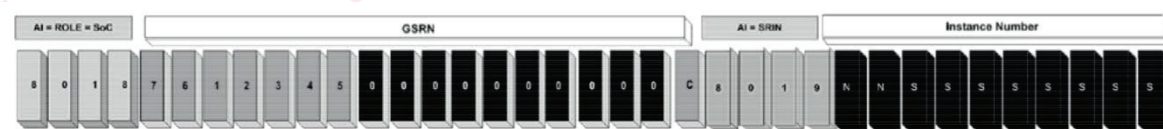
Figure 2 — Service relation instance number (SRIN)

The SRIN is an attribute to the GSRN which allows distinguishing different encounters during the same episode, or the reuse of the same GSRN in different episodes. SRIN is a 10 numeric digits variable length field. AI 8019 shall only be used in conjunction with AI 8017 or 8018; Figure 2 illustrates the combination for a SoC.