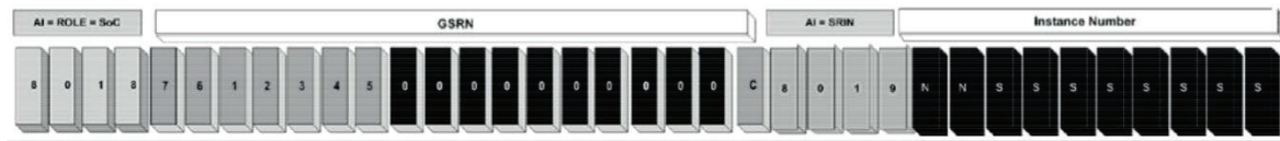
Figure 2 — Service relation instance number (SRIN)

The SRIN is an attribute to the GSRN which allows distinguishing different encounters during the same episode, or the reuse of the same GSRN in different episodes. SRIN is a 10 numeric digits variable length field. AI 8019 shall only be used in conjunction with AI 8017 or 8018; Figure 2 illustrates the combination for a SoC.