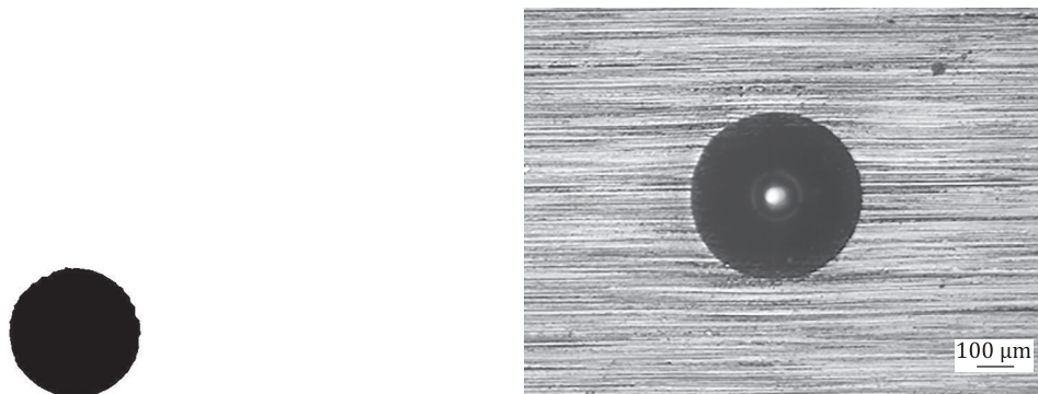
Figure A.1 — Class 0