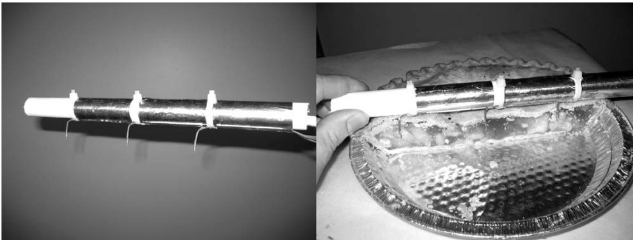
FIG. 2 Example Thermocouple Fixture for Measuring Pie Temperatures

10.2.3 Confirm that the measured input rate or power, (Btu/h for a gas rack oven and kW for an electric rack oven) is within 5% of the rated nameplate input or power (it is the intent of the testing procedures herein to evaluate the performance of a rack oven at its rated energy input rate). If the