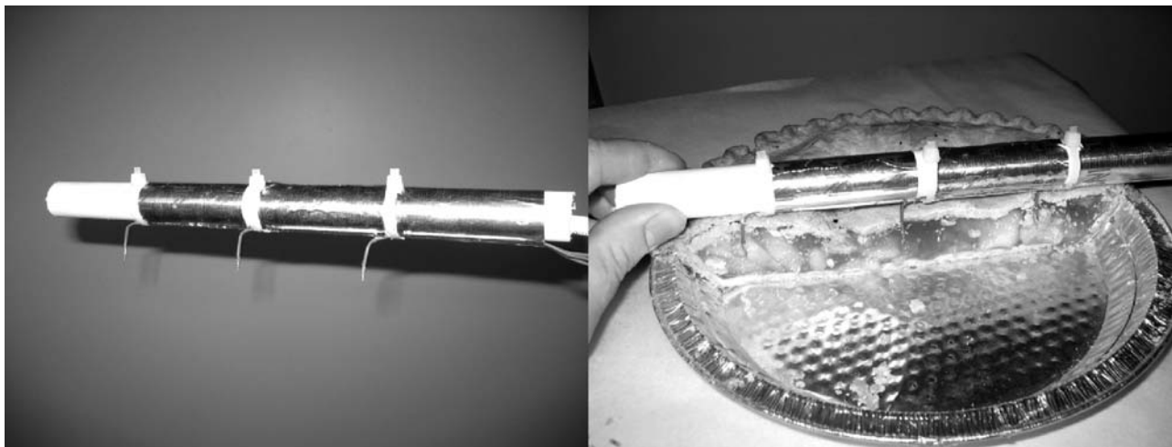
FIG. 2 Example Thermocouple Fixture for Measuring Pie Temperatures

10.1.2 For gas rack ovens, record any electric energy consumption, in addition to gas energy for all tests.