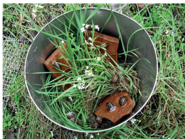
b) Open microcosm