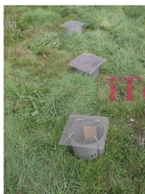
c) Microcosms covered by a stainless steel netting (mesh size: 10 mm) securely fitted over the top of the microcosm by 4 pickets