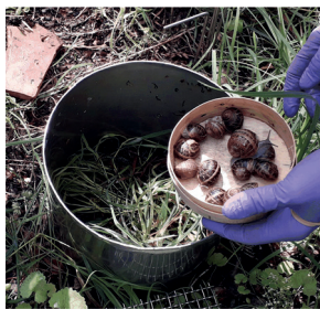
a) Sub-adult snail, total fresh mass 4 g to 6 g