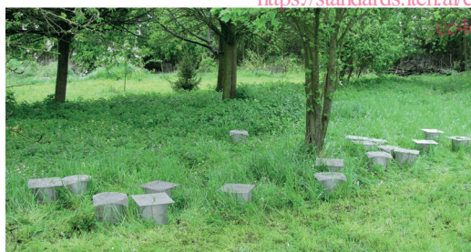
d) Microcosms on site