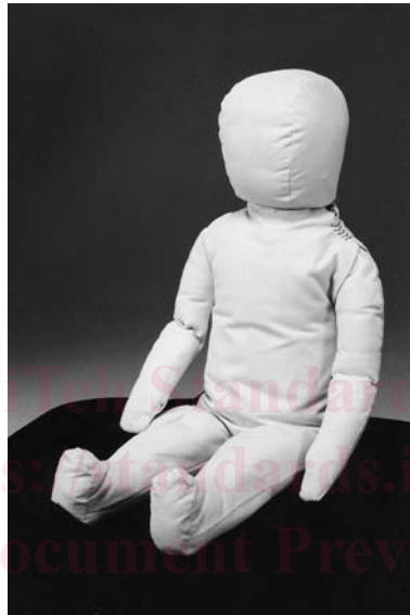
FIG. 2 CAMI Infant Dummy Mark II

6.4.2 The child restraint system shall include both waist and crotch restraint designed such that the use of the crotch restraint is mandatory when the restraint system is in use.