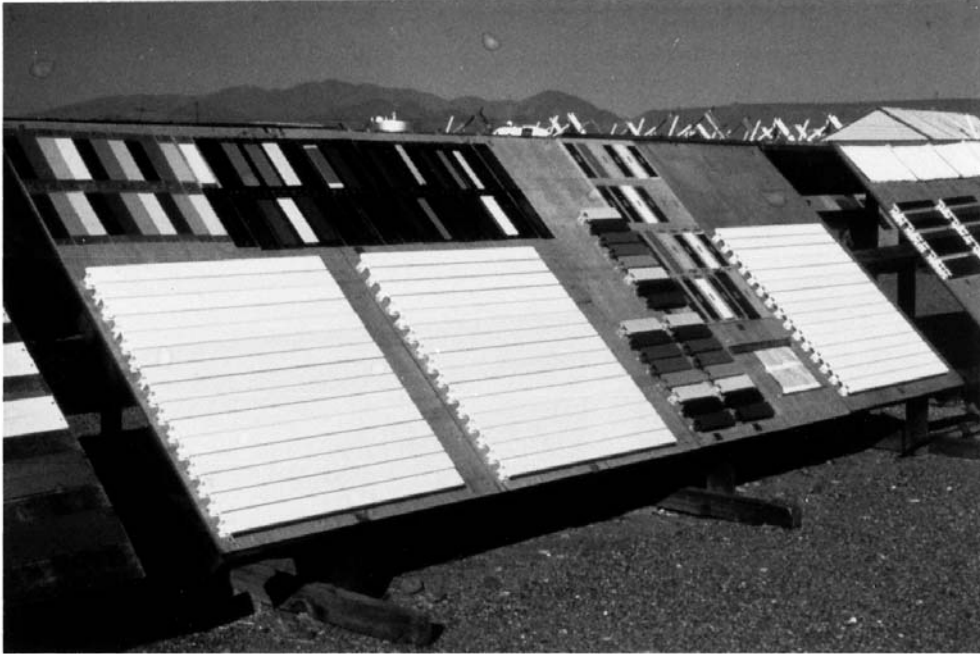
FIG. 2 Backed Exposure Rack

typical ground cover is low-cut grass. The type of ground cover at the exposure site shall be indicated in the test report. If test fixtures are placed over ground covers not typical of the climatological area (for example, rooftops, concrete or asphalt), specimens may be subjected to different environmental conditions than if using typical ground cover or exposing at ground level. These differences may affect test results.