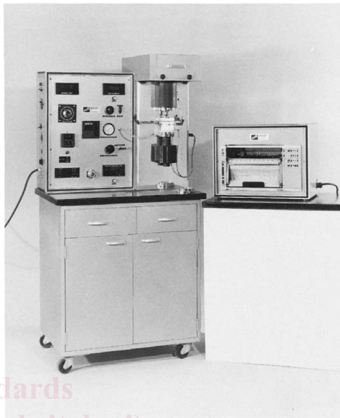
FIG. 2 Falex Variable—Speed Four-Ball Wear Test Machine

7.5 Methyl ethyl ketone —(Warning—Flammable. Health hazard.)—