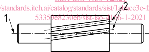
a) Helix deviation

https://standards.iteh.ai/catalog/standards/sist/1712ce3e-f577-41b0-bbd6-53359e8230eb/sist-iso-4156-1-2021