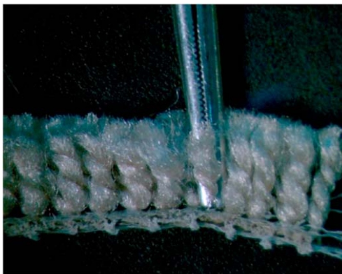
FIG. 3 Tuft Clamp Device Gripping Tuft Leg