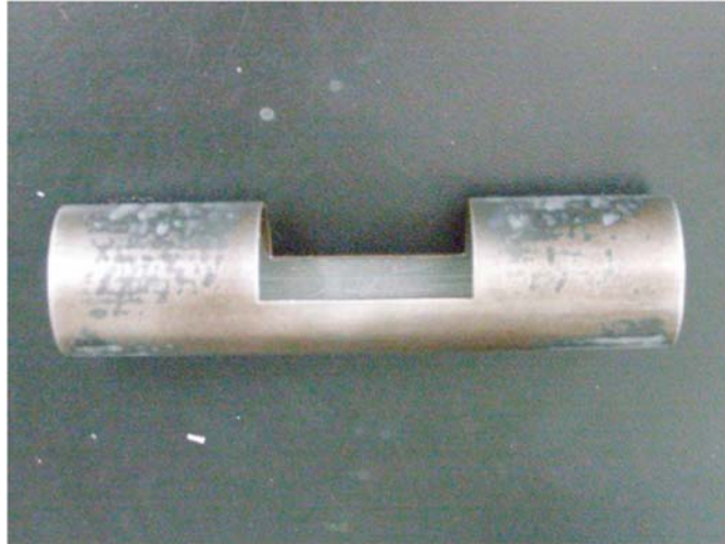
FIG. 2 Cylinder Configuration

clamping the test sample in the nonmeasuring, pulling non-measuring clamp of the tensile testing machine or replacement of the non-measuring clamp by the sample holder.