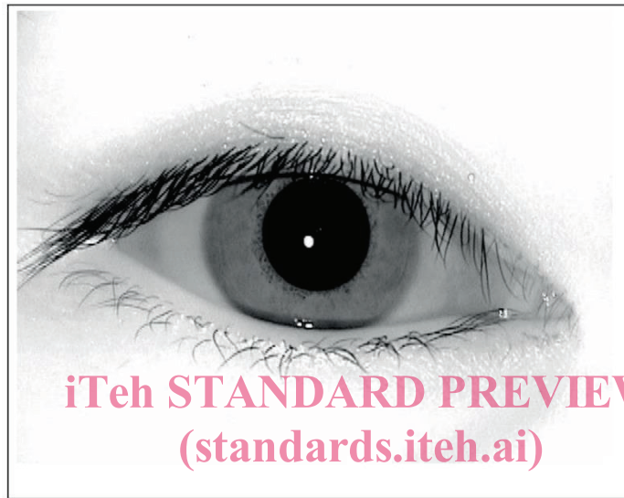
https://standards.iteh.ai/catalog/standards/sist/e04ce3e2-2d53-49b5-8fdb-dac05aa9-4c1d/iso-iec-iris-39794-6 Figure 1 — Example of uncropped iris image or VGA iris image

The VGA iris image type shall be identified in the iris record by assigning the abstract value vGA to the iris image type element in 7.3.3 , as defined in Table 3 .