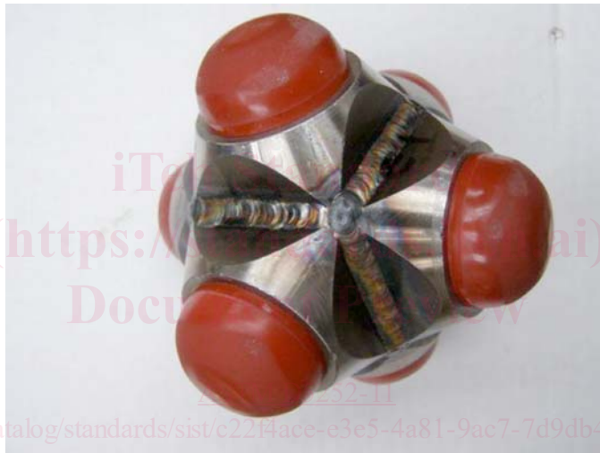
FIG. 3 8.4 lb Commercial Hexapod Tumbler