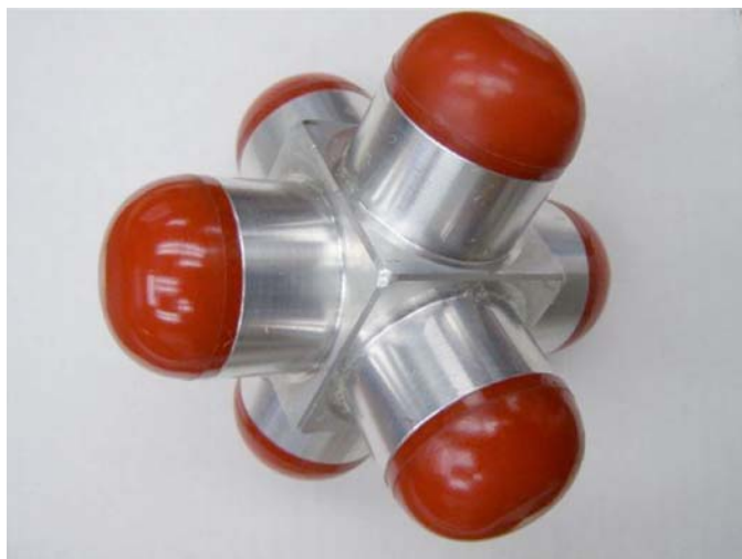
FIG. 4 2.8 lb Residential Hexapod Tumbler