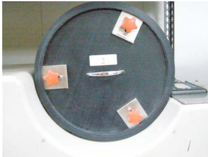
FIG. 1 Typical Front View of Drum Cover

6.1.3.3 Hexapod Tumbler Feet Specifications (see Fig. 5)—Tumbler Feet parameters are: