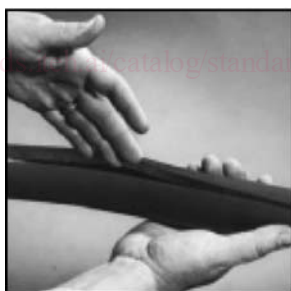
FIG. 3 Apply Unslit Insulation to Straight Pipe

10.3 Tee and Valve —Fabricate tee by cutting a V notch (45°; cut ) from straight section. Cut end of adjoining piece at 45° angle to fit into notch of section above. Apply contact adhesive to all cut faces, when properly dried, press fit insulation sections firmly together. Slit open the completed fitting section, apply contact adhesive to all exposed insulation wall faces, place cover over tee when adhesive is properly set and apply pressure to bond the fitting insulation. See Fig. 7.