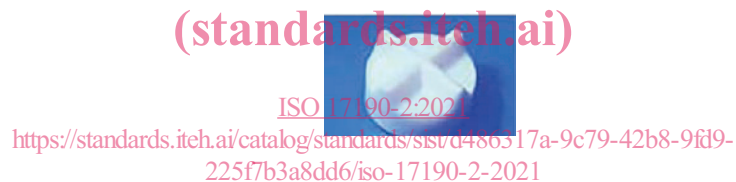
Figure 1 — Cowie double crosshead stir bar (typical dimensions: 20 < d < 25 mm, 12 < h < 18 mm)

6.7 Magnetic stirrer and stirring bar. Cylindrical stirring bars can be unstable when used on a multipoint magnetic stirring block. The mixture of magnetic fluxes can cause the bar to freeze periodically. Both cylindrical and star-shaped stirrers can tear the gel. It is recommended to use a cross-centred circular bar (see Figure 1 ), which provides more stable stirring and minimum tearing of the gel. It is also important to make sure that the cross is properly centred in the circle. Cheaply made versions can be off-centre and this increases variability in the test.