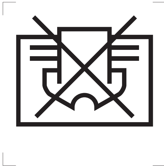
Figure G.3 — Not suitable for covering iTeh STANDARD PREVIEW (standards.iteh.ai)

ISO 18326:2018/FDAmd 1 https://standards.iteh.ai/catalog/standards/sist/39beeca4-da5f-41d0-adba-a870f92e52d8/iso-18326-2018-fdamd-1