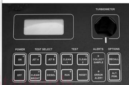
FIG. 2 Micro-Separometer Mark X and Associated Control Panel

lettered pushbuttons will sequentially illuminate on and off indicating READY operational status.