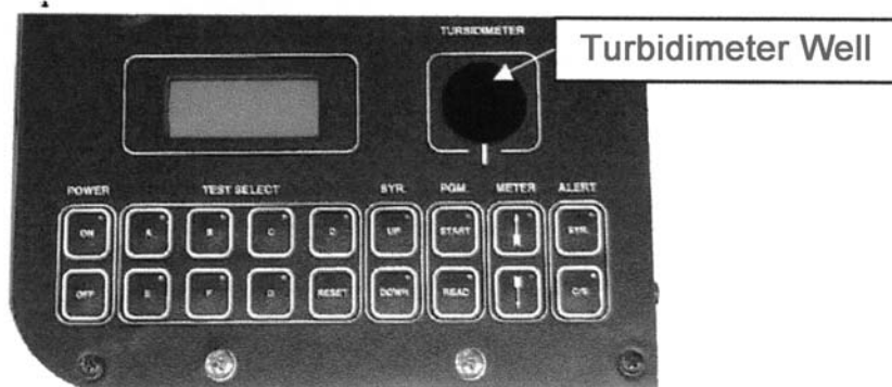
FIG. 1 Micro-Separometer Mark V Deluxe and Associated Control Panel