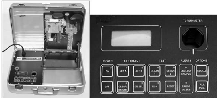
FIG. 2 Micro-Separometer Mark X and Associated Control Panel