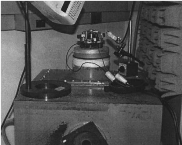
FIG. 1 Motor Mounted to Plenum Chamber