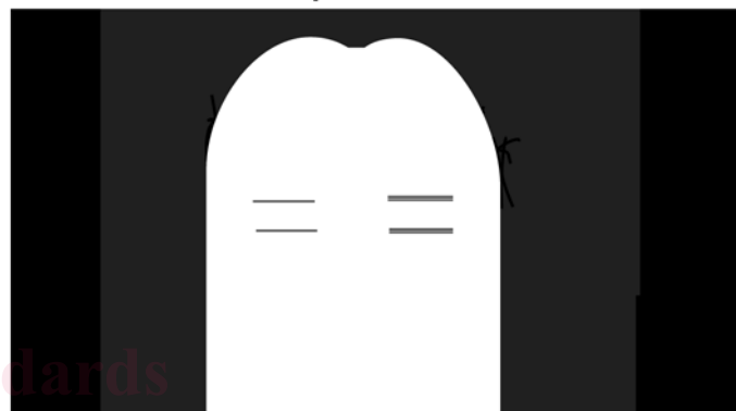
Test Method B: Ratio of Cycles to Failure of Test Paint and Reference Paint