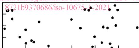
Figure B.3 — A = 2\% , d = 1\text{ mm} , 30 pores

https://standards.itech.ai/catalog/standards/sist/07e82de5-fa36-4128-9367-8721b9370686/iso-10675-1-2021