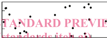
Figure B.2 — A = 1,5\% , d = 1\text{ mm} , 23 pores

https://standards.itech.ai/catalog/standards/sist/07e82de5-fa36-4128-9367-8721b9370686/iso-10675-1-2021