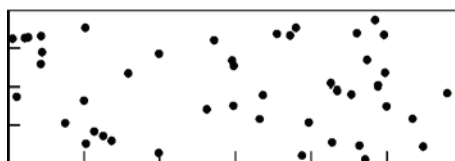
Figure B.5 — A = 3\% , d = 1\text{ mm} , 45 pores