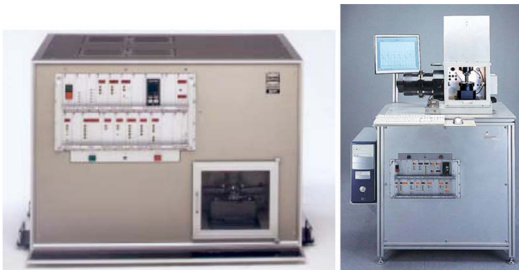
FIG. 1 SRV Test Machine, Model III (left), Model 4 (right)

3.1.6 lubricating grease, n —a semi-fluid to solid product of a dispersion of a thickener in a liquid lubricant. D217