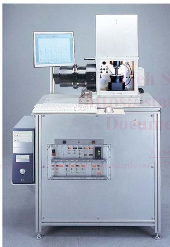
NOTE 1—Above: Model III; Below: Model IV

9.3 Place the grease using a calibration ring while ensuring that the grease is applied to a height of 0.2-0.3 mm above the metal test disk.