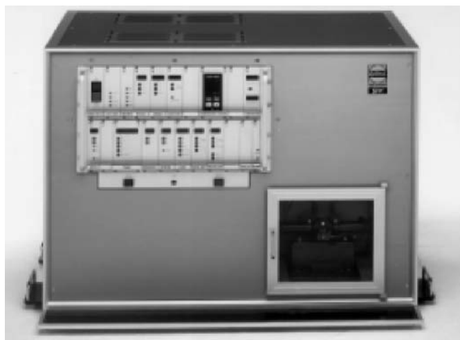
FIG. 1 SRV Test Machine (Model III)

NOTE 3—With regard to the test chamber and the operating conditions, SRV models III and IV are identical. However, the SRV IV allows to incline the axis of movement. Both models are fully computer controlled. In SRV IV models, the test described here is run horizontally and without inclination. SRV I and II models can also perform this test, but they are limited with regard to maximum load and stroke. As modern and high performance oils may exceed an O.K.-load of 1200 N, seizure may not be