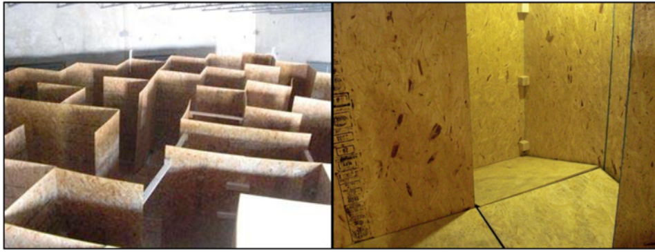
FIG. 1 HSI: Search Tasks: Random Maze Illustration