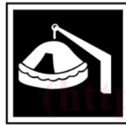
(d) Davit Launched Liferaft