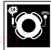
(j) Lifebuoy with Light and Smoke