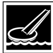
(f) Evacuation Slide