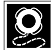
(h) Lifebuoy with Line