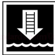
(e) Embarkation Ladder