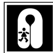
(l) Child's Lifejacket