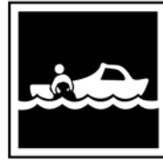
(b) Rescue Boat