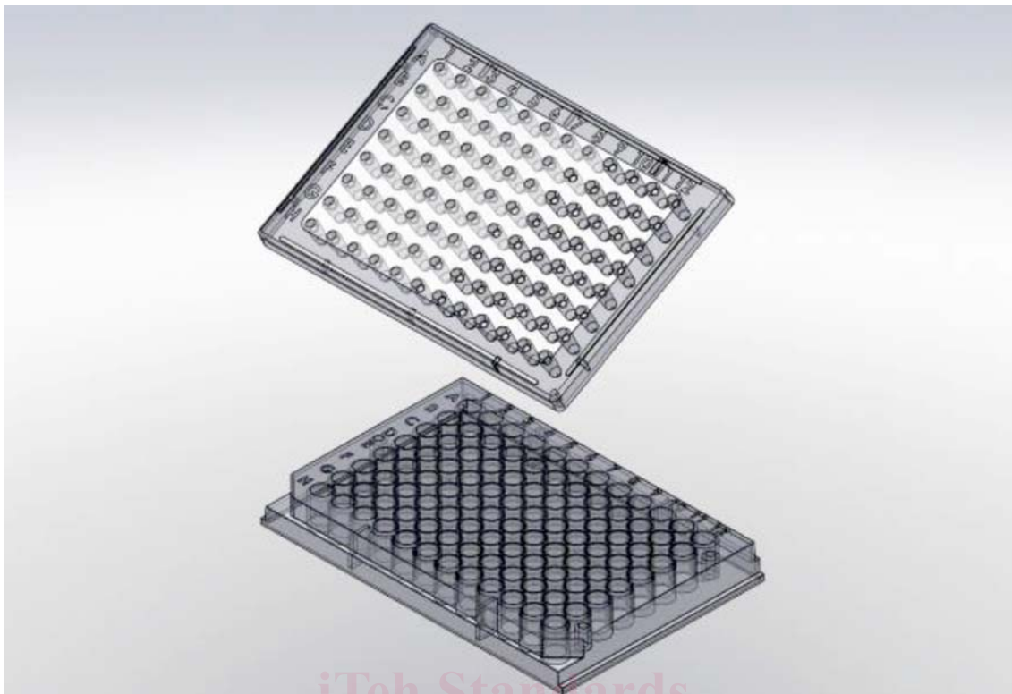
96-well tissue culture plate (bottom) and corresponding 96-peg lid (top).