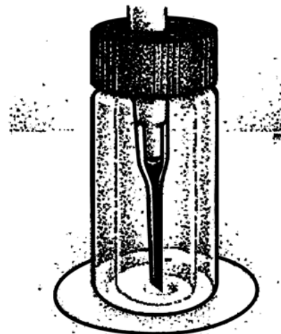
D. Carrier Inoculation