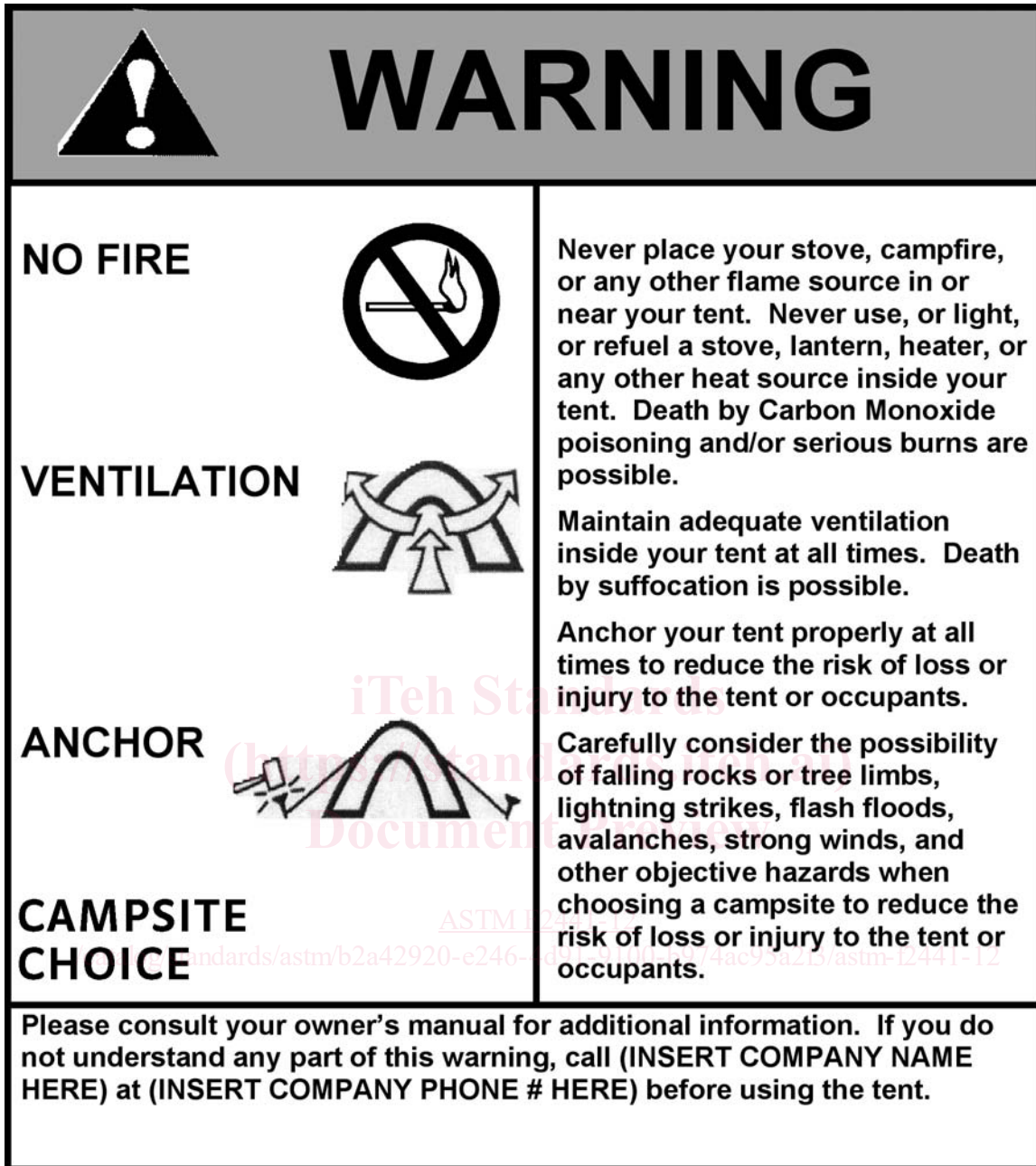
FIG. 1 Tent Label