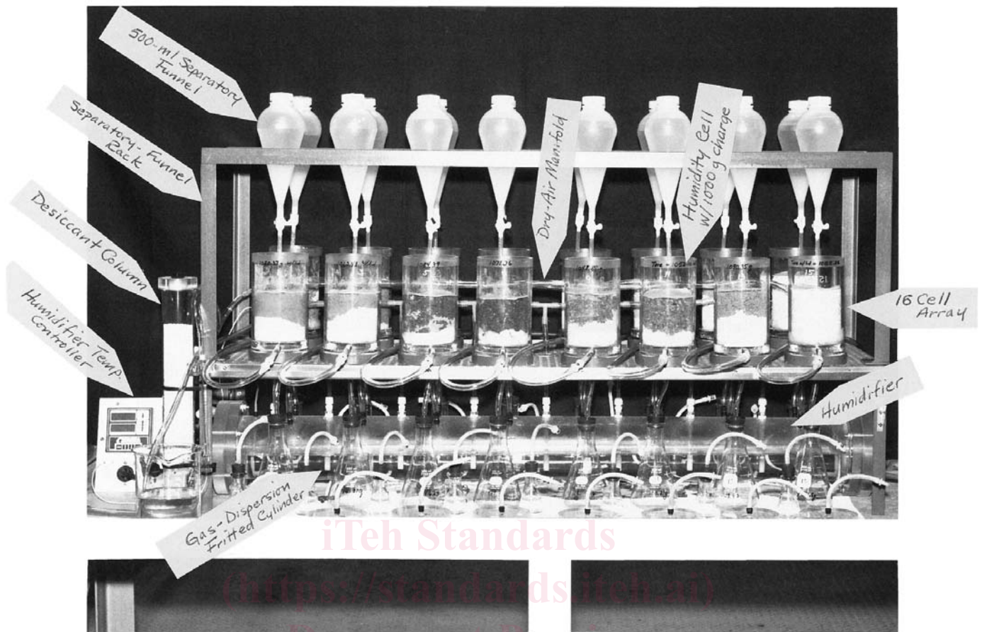
FIG. 2 Front View of 16-Cell Array (Option A) with Separatory Funnel Rack

10.3 Option A and B —A separatory funnel rack is mounted on the table that holds the cells if the weekly water leach is applied dropwise (drip leach). Multiple separatory funnels (one for each cell) are held in the rack during the drip leach that is performed on the seventh day of each weekly cycle (Fig. 2, Fig. 4). The separatory funnel can be used to meter the required water volume slowly down the sides of the cell wall until the sample is flooded if the weekly leach is to be a flooded leach.