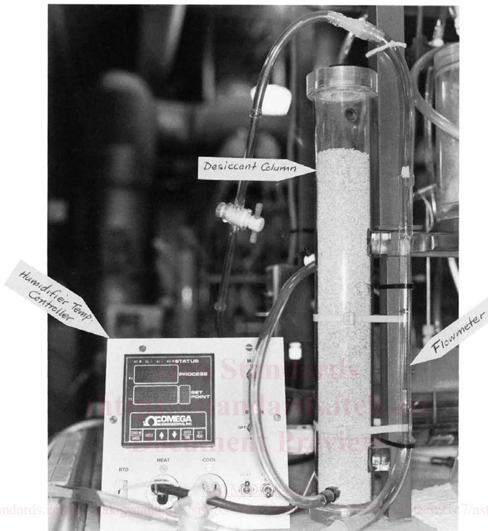
FIG. 3 Detail of Desiccant Column and Flow Meter

and sulfate release rates were consistently within 10 % of the mean. Consequently, because there was little difference between results from the two leach alternatives, and to simplify the method protocol, the flood-leach alternative is designated as the preferred water-leach application method. This does not preclude use of the drip-leach application if the flood-leach application becomes impracticable.