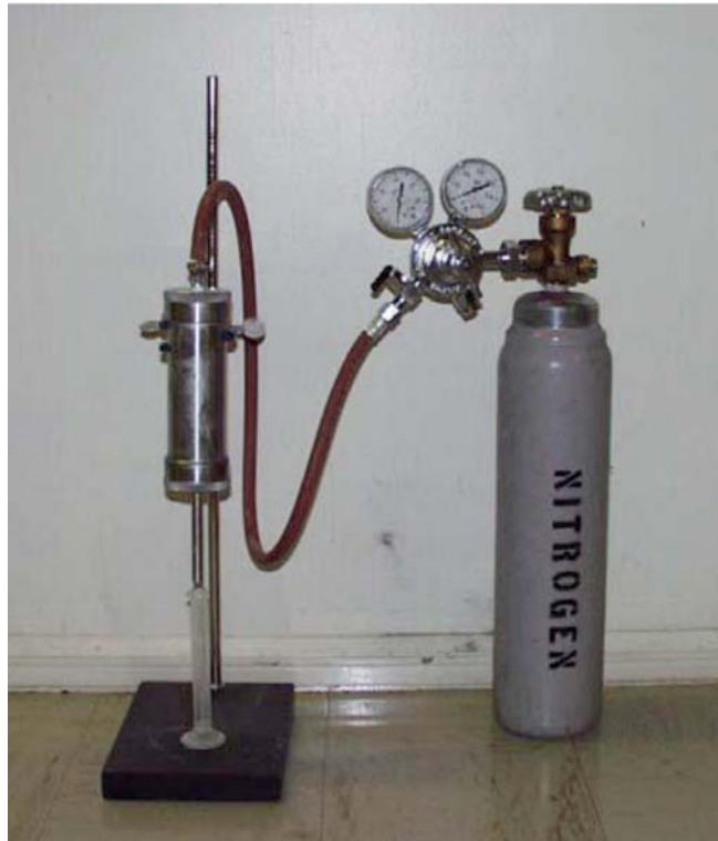
FIG. 1 Test Apparatus