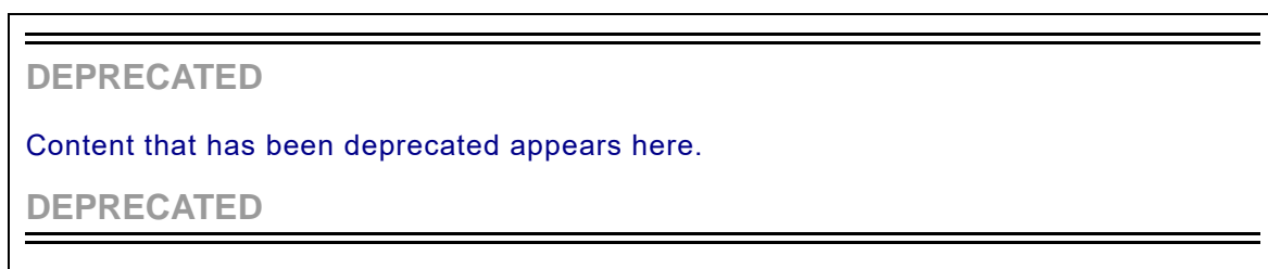
Figure 4 - Deprecated Tag

Deprecated sections are documented with a reference to the last published version to include the deprecated section as normative material and to the section in the current specification with the replacement. Figure 4 contains a sample of the typographical convention for deprecated content.