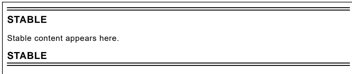
Figure 3 - Stable Maturity Level Tag

maturity level shall not rely on any content that is Experimental. Figure 3 is a sample of the typographical convention for Implemented content.