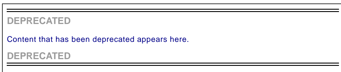
Figure 4 - Deprecated Tag

Deprecated sections are documented with a reference to the last published version to include the deprecated section as normative material and to the section in the current specification with the replacement. Figure 4 contains a sample of the typographical convention for deprecated content.