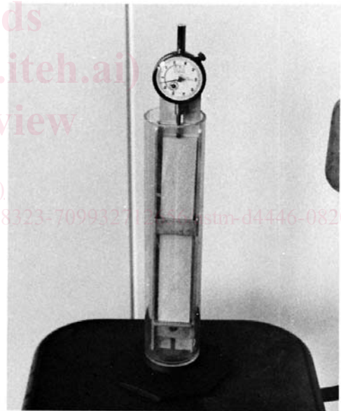
FIG. 3 Single Test Swellometer Tank—With One Sample In Place

made, pour equal amounts of the two solutions together and then apply to the wood surface by means of brushing or dipping. The sapwood immediately shows a yellowish color, while the heartwood turns dark red-brown. The colors remain distinct after drying.