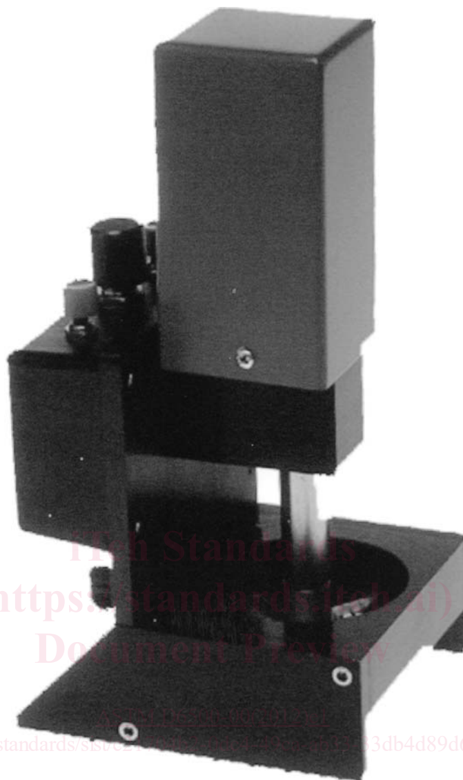
FIG. 5 Slide Spreader

6.11 Solvents —Petroleum spirit (boiling range 40 to 70°C) and 1,1,1, trichloroethane. When the preparation method calls for the cleaning of sliver subsamples, one of these two solvents shall be used. Warning —Both solvents have associated hazards in terms of volatility, toxicity, and, in the case of petroleum spirit, flammability. In both cases, care should be taken in storage, handling, use, and disposal in accordance with the appropriate safety procedures. Refer to manufacturers' material safety data sheets (MSDS).