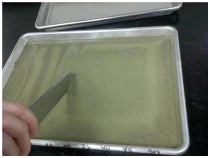
FIG. 1 Full-Depth Cut in Test Specimen

mortar and will require several batches to complete the testing. In order to ensure valid comparisons, all tests shall be conducted at the same water content. The liquid content using the amount and type of liquid prescribed by the manufacturer (See Note 2). In the absence of manufacturer's instructions the correct water liquid content shall be established by using an initial trial batch for that purpose. Water Liquid content shall be adjusted to achieve a flow of from 125 to 150 mm [5 to 6 in.] or as otherwise specified by the manufacturer. in.]. The trial batch shall not be used for specimen preparation. It will then be necessary to mix additional batches of material using the same amount of water liquid as the was established for by the trial batch. Always use freshly mixed material for each test.