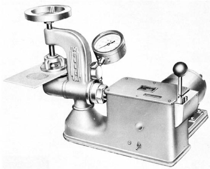
FIG. 1 Mullen Tester, Model A

openings in the two clamping plates shall be substantially concentric with no overlapping of any point.