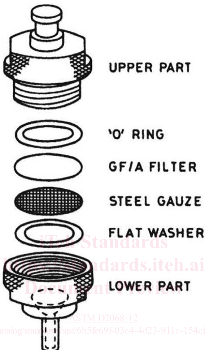
FIG. 1 Assembly of Filter A

6.2.1.1 Filter Housing , 6 stainless steel, nominal 13 mm diameter with a Luer fitting at the top where it connects with the filtration apparatus. Fig. 1 shows the assembly.