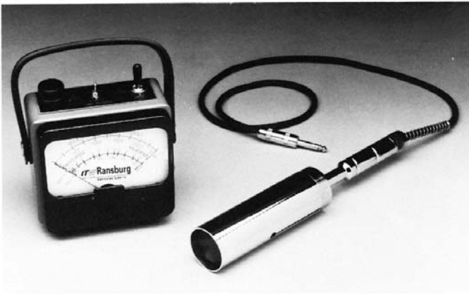
FIG. 1 Analog Paint Application Test Assembly