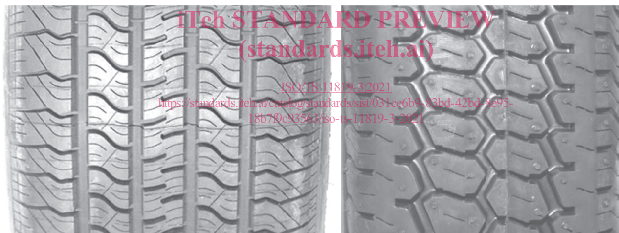
a) Tyre P1

For tyre H1 it has appeared that at least a few samples of this tyre have been manufactured with a misaligned tread pattern, as illustrated in Figure 3 . The grooves running in the lateral direction shall not be totally blocked by the misalignment (although a thin “skin” at the joint between the two halves of the tread is normal). Therefore, the type of misaligned pattern in Figure 3 b) is not acceptable, whereas the one illustrated in Figure 3 a) is acceptable.