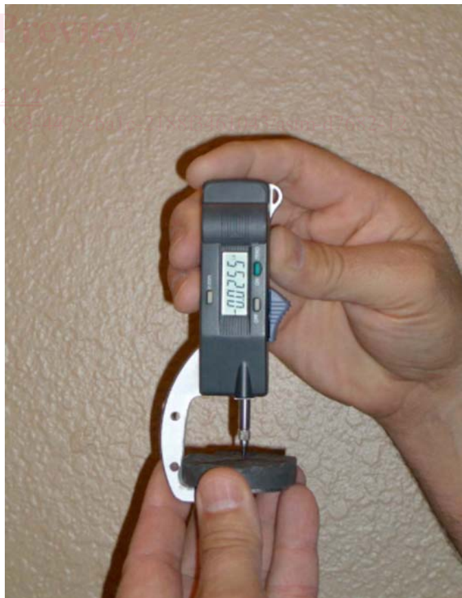
FIG. 2 Micrometer Measuring a Replica Coupon

9.1.1 Date, test location, and replica coupon label numbers.