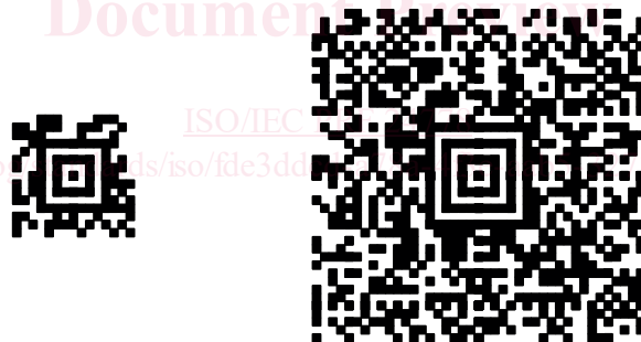
Figure 1 — Representative Aztec Code symbols

Aztec Code symbols are nominally square, made up of square modules on a square grid, with a square bullseye pattern at their centre. Figure 1 shows two representative Aztec Code symbols, a small 1-layer symbol on the left which encodes 12 digits with 47 % error correction, and a larger 6-layer symbol on the right which encodes 168 text characters with 30 % error correction.