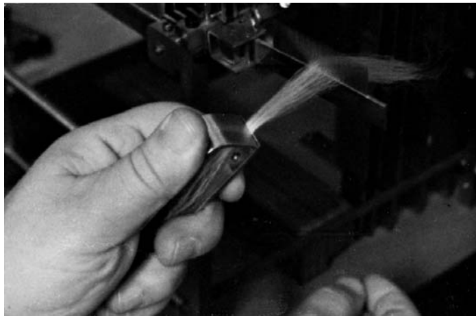
FIG. 1 Combing of Bundle