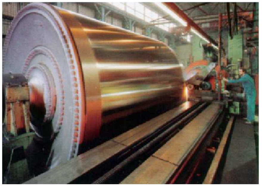
FIG. 1 Yankee Dryer Drum

5.6 Maximum Examination Pressure—Maximum Allowable Working Pressure for cast iron vessels is set based on ASME (Section VIII) pressure calculations based on thickness, radius, and material strength values, and will not exceed 10 bar [160 psi] and 230°C [450°F] (ASTM A278). When vessels are pressurized, anomalies produce emission at pressures less than normal fill pressure. Historically, if there is damage in a cast iron pressure boundary, AE activity will begin at load/stress levels less than 50 % of operating. Defects as small as 3 mm [½ in.] have been found using AE, during steam pressurization to operating pressure.