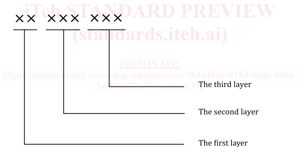
Figure 2 — Diagram of layer code structure

7.1.3 The structure of layer code can also be represented by a schematic diagram, as shown in Figure 2 .